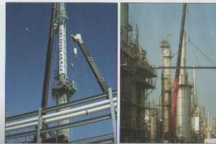
SKS ... working without lost-work-day

The group, which aims to be the most reputed EPC contracting company in oil and gas sector in Kuwait and the Middle East, is now planning a major expansion programme